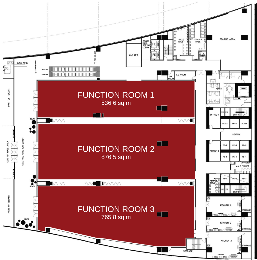
3 RD LEVEL (FUNCTION ROOMS 1-3)