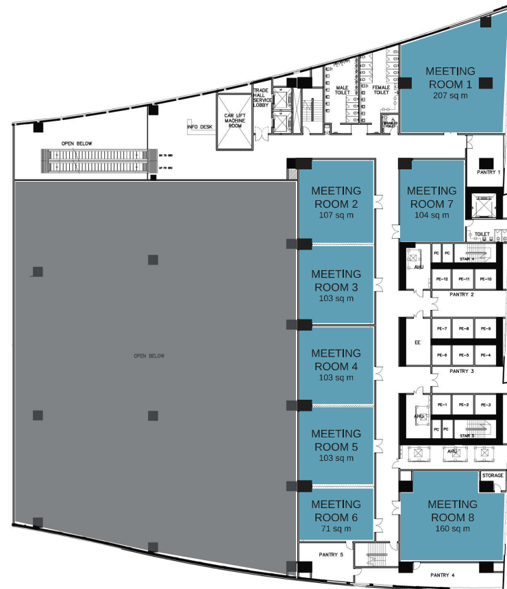
4 TH LEVEL (MEETING ROOMS 1-8)